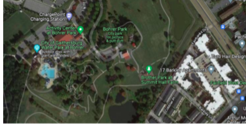
Figure . Bohrer Park, on the northwestern boundary of the community, offers an opportunity for a variety of volunteer stewardship projects.