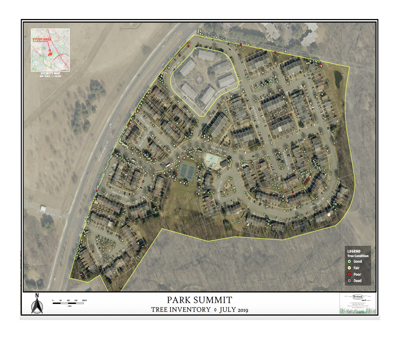
Appendix D: Tree Inventory Map