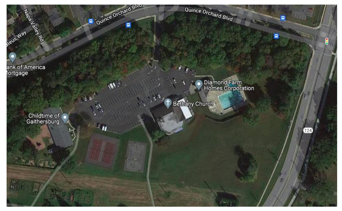
Figure 2. Pool parking can be used for shared use parking and/or retrofit with permeable asphalt

The pool parking area is very large, and could benefit from an analysis of a "shared use" parking arrangement, and also a stormwater retrofit with pervious asphalt.