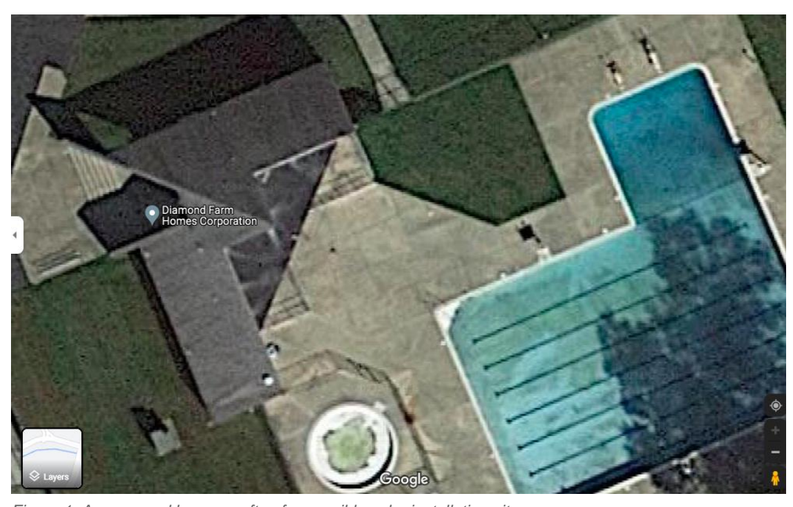
Figure 1. Assess pool house rooftop for possible solar installation site

Assess whether solar is a viable option for the pool house roof. Solicit estimates from solar installers.