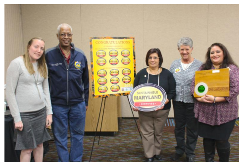
City of Bowie, our 2016 "Sustainability Champion"

Go to the map of Sustainable Maryland municipalities and click on a town or city to view their individual certification reports.