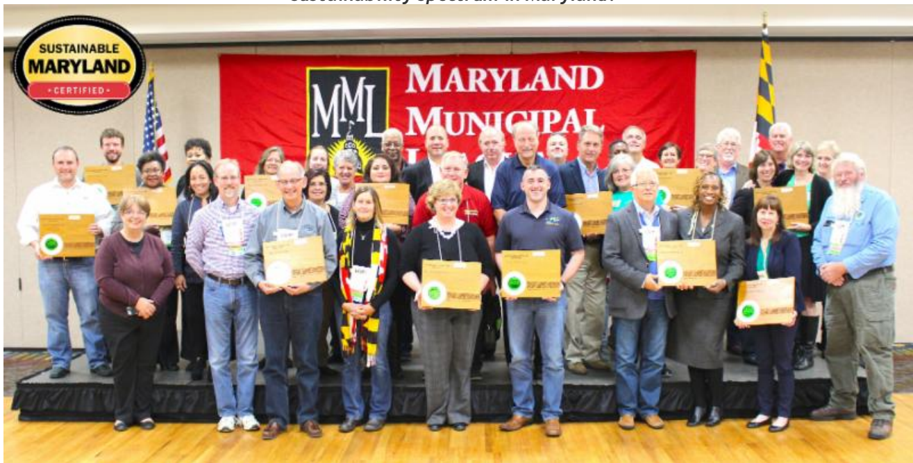
2016 Class of Sustainable Maryland Certified municipalities, at the Maryland Municipal League's annual Fall Conference in Solomons, MD on October 14

Our monthly sampling of news, resources, events and other items of interest from across the sustainability spectrum in Maryland.