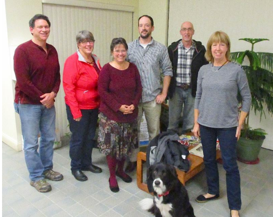
Walkersville Green Team

For the First Time, Salisbury Wins Sustainable Maryland Certified Award Link