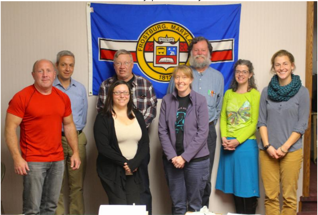
Frostburg's new Green Team

Our monthly sampling of news, resources, events and other items of interest from across the sustainability spectrum in Maryland.