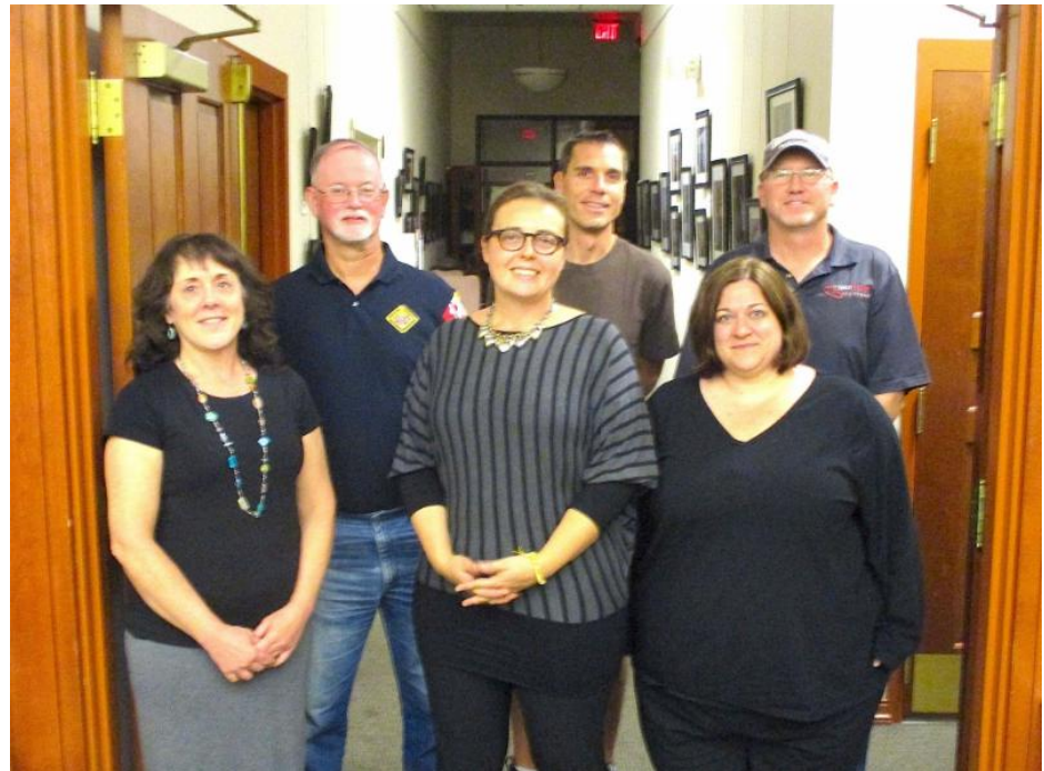
Mount Airy Green Team

Walkersville (Frederick County) has a community garden, a water conservation plan , and their town-wide yard sale keeps useful items out of the landfill.